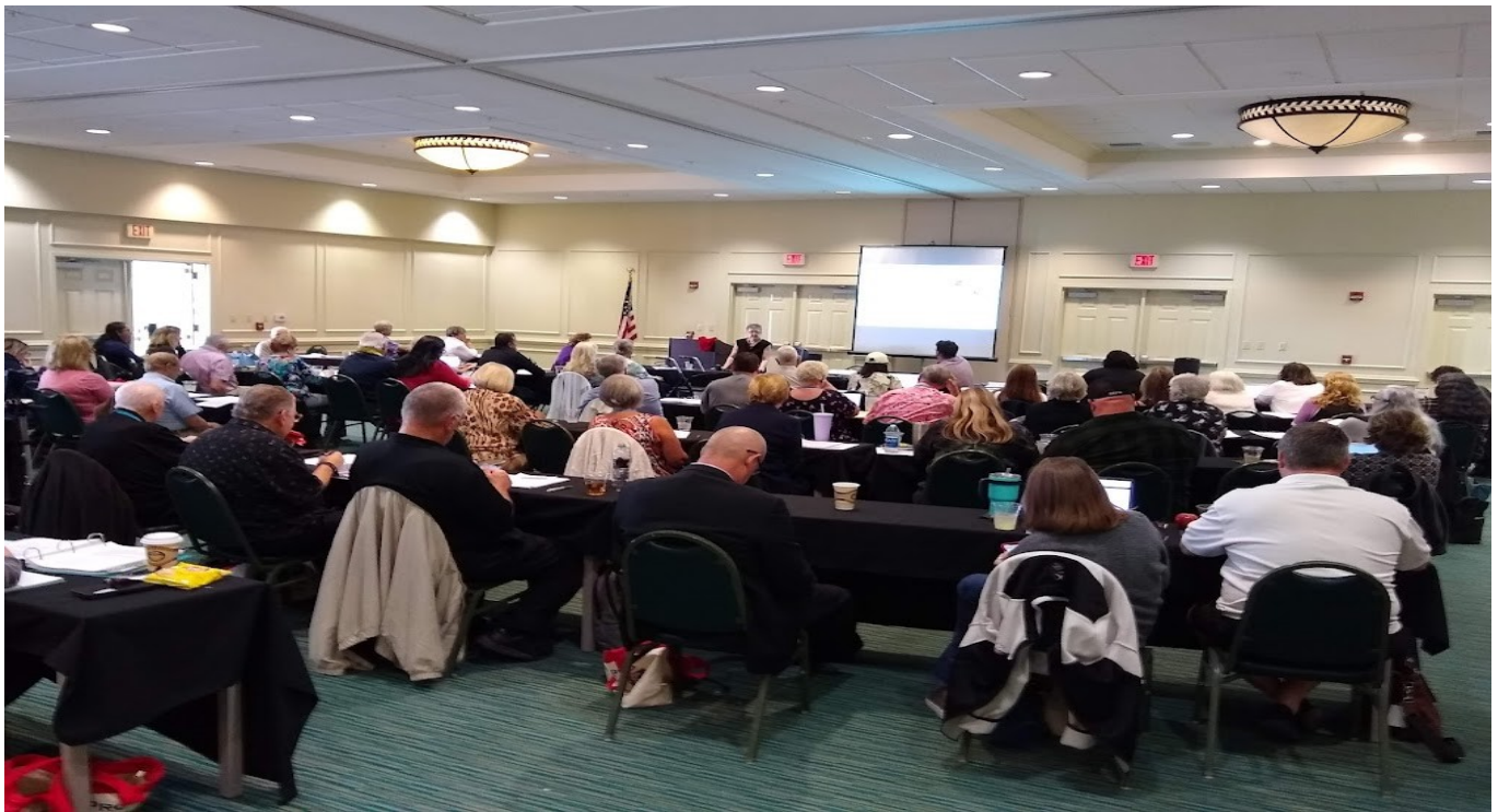
Plantation Inn conference room. Where are you?