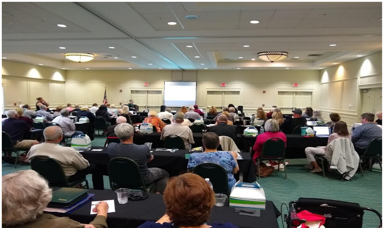
The conference room was filled almost to overflowing.