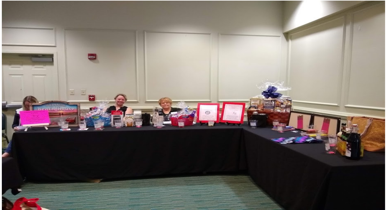
Our Scholarship Fund raffle table. .