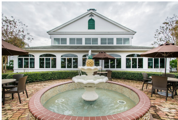
PLANTATION ON CRYSTAL RIVER COURTYARD

Real estate investors can use Section 1031 to defer gain on the sale or exchange of real property. This course will detail Section 1031 exchange mechanics and the tax results of using Section 1031 to the taxpayer. The use of Section 1031 in tax planning will also be discussed. Learning objectives: Describe how a real estate exchange qualifies for Section 1031 deferral. Calculate the tax results of a typical Section 1031 exchange to the taxpayer. Explain what constitutes real property for Section 1031 purposes.